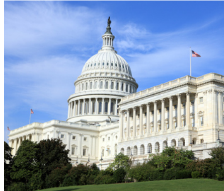
United States Capital Building

Background facts. The NRRRA provides, among other things, that surplus lines premium taxes on multi-state risks will be paid to the Home State of the insured, as opposed to the surplus lines agent/broker determining the amount of risk residing in each of the states and allocating a proportionate percentage of the risk in each of those states and then calculating and paying the appropriate surplus lines premium tax in each state. The intent of Congress, as set forth in §101(b)(4) is for a nationwide system to be developed whereby “each State will adopt nationwide uniform requirements, forms, and procedures,