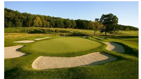
Bedford Springs Old Course