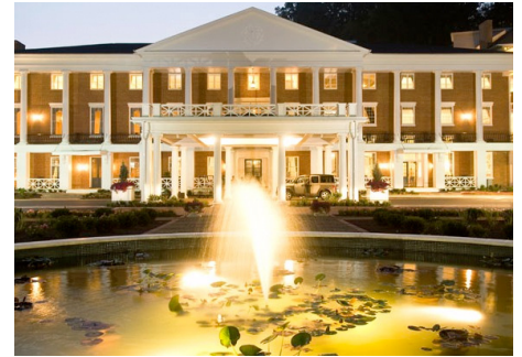
Omni Bedford Springs Resort

Resident and non-resident surplus lines agents and brokers rarely have an exclusive opportunity like this to hear from state industry specialists who will help members to chart their way through the new regulations and changes that have already occurred – as well as those that lie on the horizon.