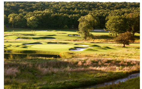
Bedford Springs Old Course

Registration materials for the PSLA's Annual Meeting May 11th & 12th, 2011 will be sent to members in the immediate future.