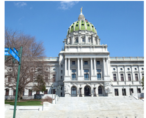
Pennsylvania State Capital Building in Harrisburg

The Surplus Lines Task Force of the National Association of Insurance Commissioners (NAIC), proposed an alternative to SLIMPACT called: the “Non-Admitted Insurance